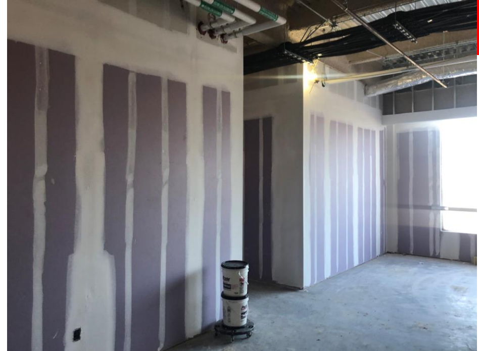
Gypsum Board Wall Progress 2 nd Floor Counseling Area of New Addition