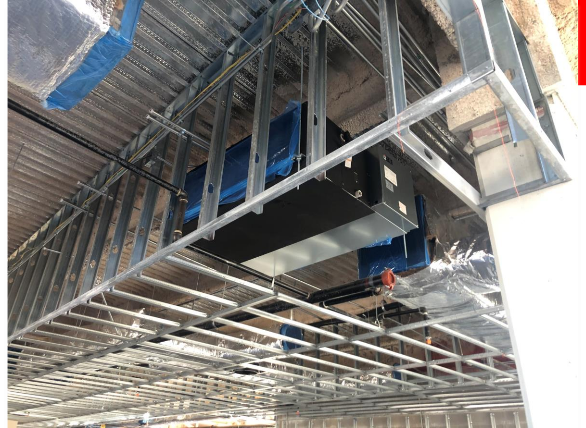
HVAC Units Mounted on First, Second, and Third Floors