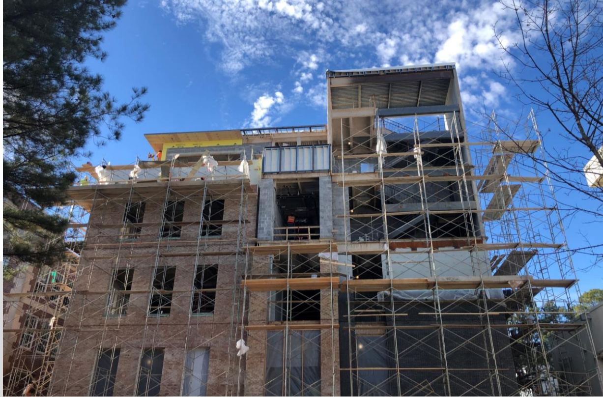
New Addition Progress – East Elevation