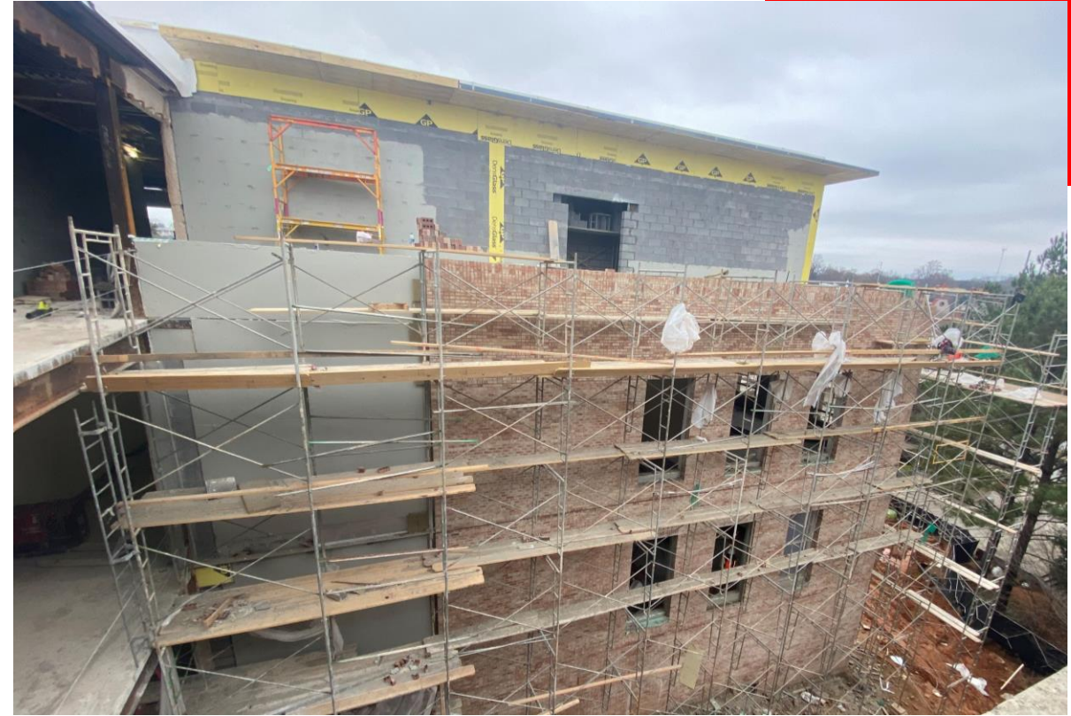
New Addition Progress – South East Elevation