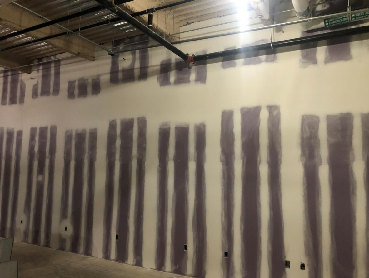
First Floor Gypsum Board Walls Ready for Paint and Primer