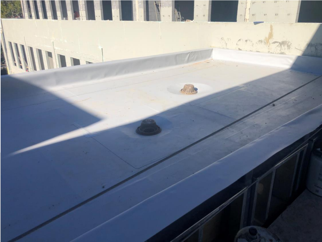
Grey TPO Roof Installed at Bridge and C. Allen Building Low Roof