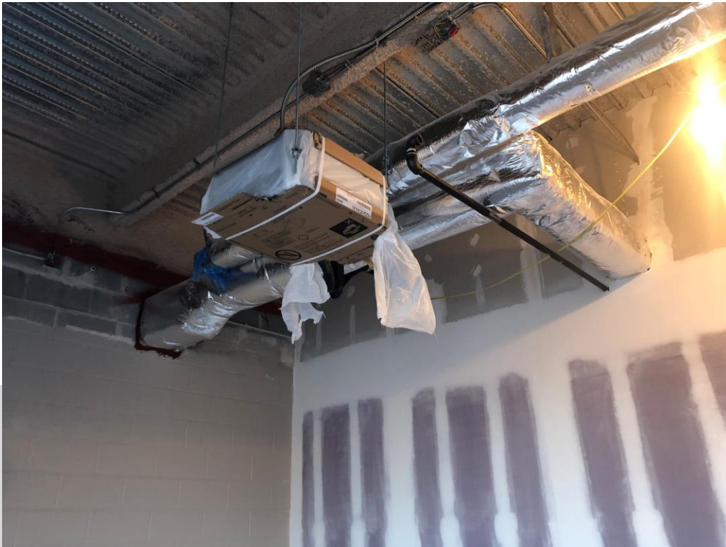
HVAC Units Mounted on First, Second, and Third Floors